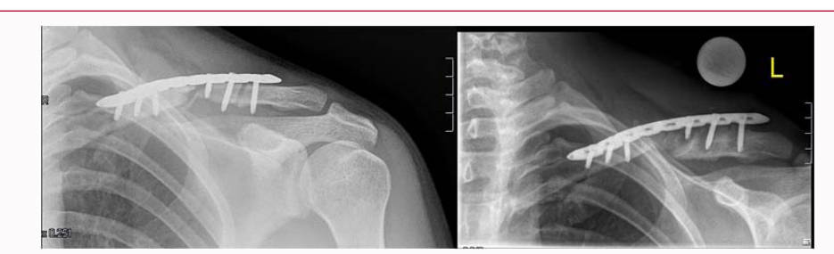
Figure 1: Non-union of middle third clavicle fractures after three ORIF operations-with plate in situ.